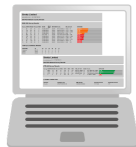
Downloaded HTML Survey Results