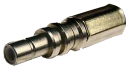
SMB Female (jack)

Female centre pin. The SMB female slots inside the male connector and 'clicks' into place.