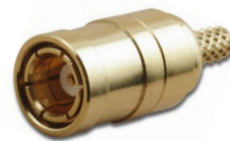
SMB Male (plug)

Female centre pin. The SMB female slots inside the male connector and 'clicks' into place.